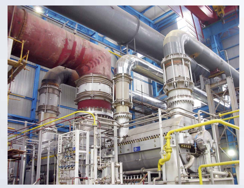
Compressor train at Wuhan plant

Wuhan Iron & Steel Group is one of the world's largest steel producers and number three in China. The Wuhan plant uses non-cooled furnace gas from pig iron production to power two 120 MW gas turbines. Gas compression is required to raise the pressure of the furnace gas to the turbine combustion chamber pressure. Large cogen plants in steel mills typically employ very large horizontally split compressors to achieve high flow rates at relatively low delivery pressures, in this case 20 barg (290 PSIG). It wasn't cost-effective to pre-cool the furnace gas prior to compression or use more than two compressors per turbine. Each of the two compressor power trains was planned with a pair of centrifugal compressors with horizontally split casing, one with a 390 mm (15.35") shaft diameter, the other a 330 mm (12.99") diameter. The larger compressor would be the largest of its type ever built, requiring dry gas seals with the same 390 mm (15.35") shaft diameter designed for high temperature operations. Such a seal didn't exist yet.